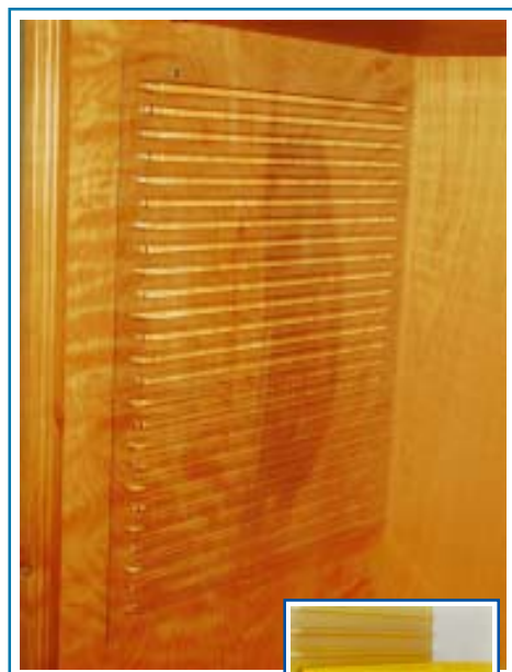
New clear tray panel shown in oak cabinet