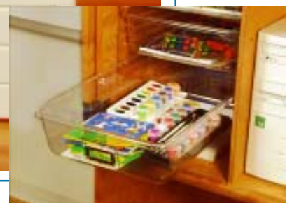
Easy Pull Out Tray Panel System