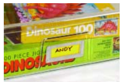
Standard ID Name Plate Holder

New clear plastic school trays shown in a cabinet arrangement with the new Fabri-Form clear plastic tray mounting system that allows the panels to disappear into the cabinet.