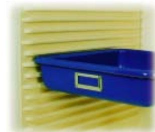
P-1028 with Blue Tray