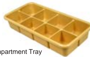
8 Compartment Tray