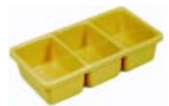
3 Compartment Tray