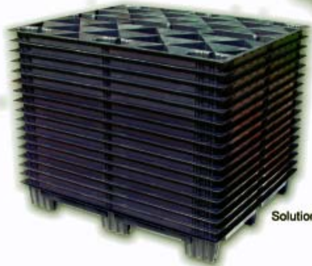
Solution EX Pallets Nested

The Fabri-Form Company Introduces the Solution Pallet EX